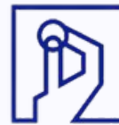
สมาคมส่งเสริมการลงทุนไทย THAI INVESTORS ASSOCIATION